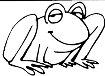
2 Frogs everywhere Exodus 8:6