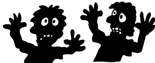
9 Darkness for 3 days Exodus 10:22