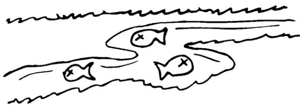
1 River turned to blood Exodus 7:21