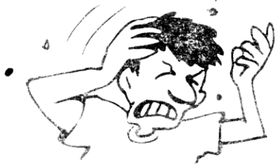
3 Gnats Exodus 8:17