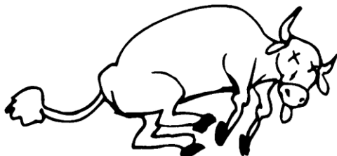
5 Livestock died Exodus 9:6