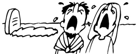
10 Death of firstborn Exodus 12:29