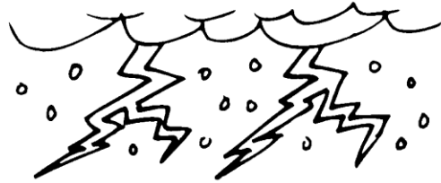
7 Lightning and hailstorm Exodus 9:23