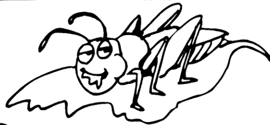
8 Locusts Exodus 10:14