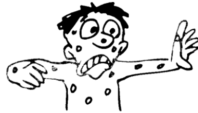
6 Boils (skin sores) Exodus 9:10