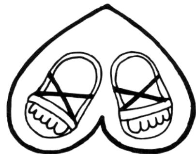
Feet pattern for base of shepherd figure