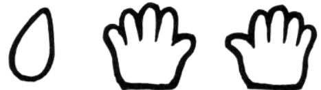
Patterns for the lamb's ear and tail and the shepherd's hands